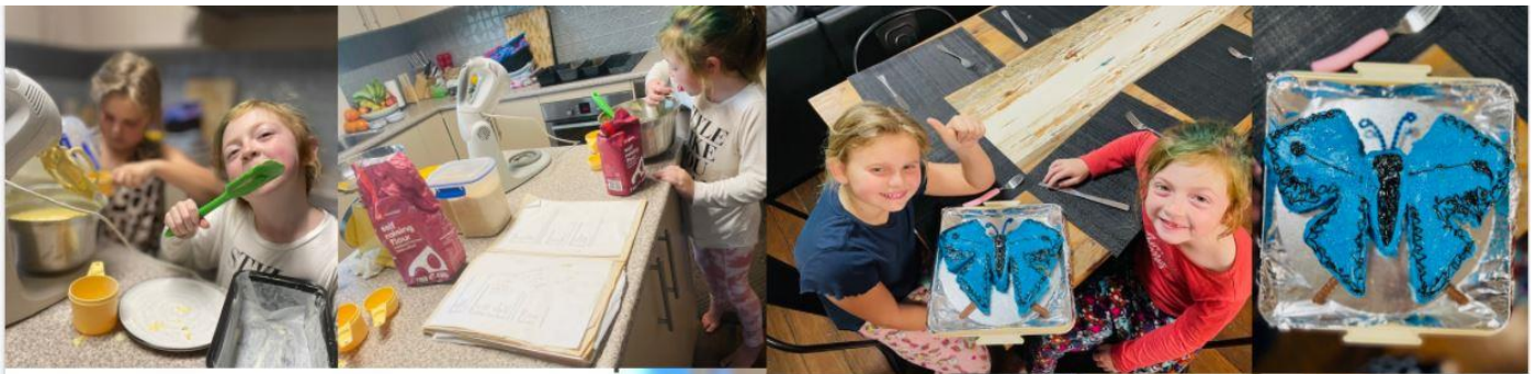
The Ulysses Butterfly ↗