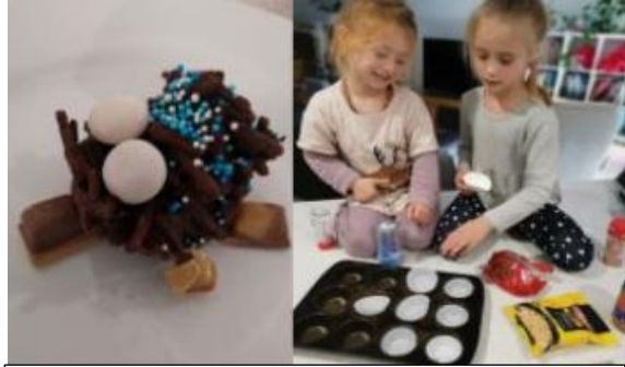
Long Beaked Echidna