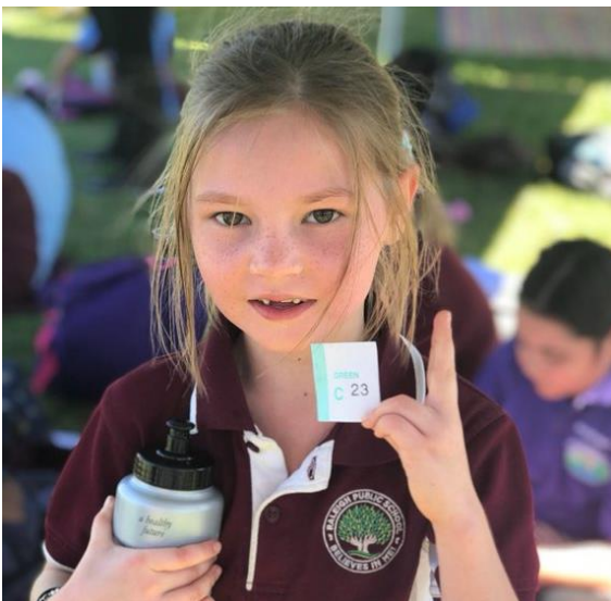
District Cross Country 2018