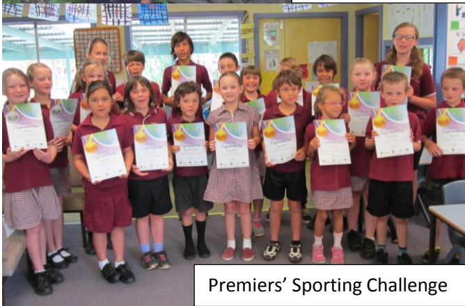
Premiers' Sporting Challenge