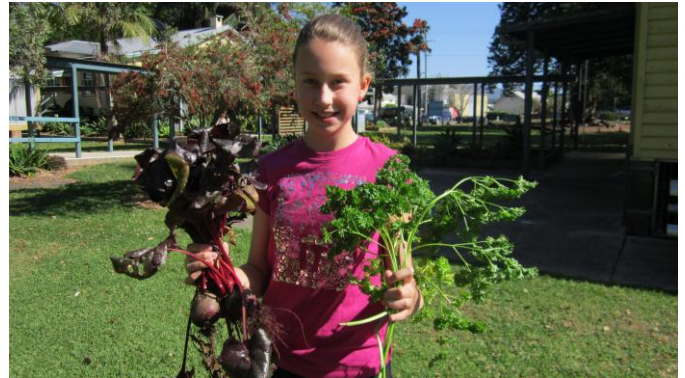
Fresh from the Garden!

Brochures have been handed out to interested students. Orders and money are due by Friday 21 st November. Cheques may be made payable to Raleigh Public School.