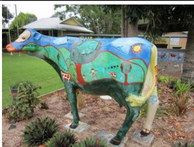
2014, paint peeling badly!