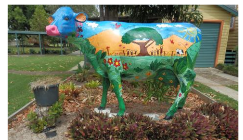
Looking good Bessie!