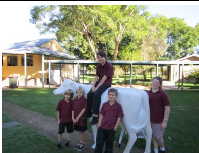
2012, our blank canvas!

If you haven't seen her new 'look' in the flesh, you'll find her moo-ved back into the front garden for all to enjoy.