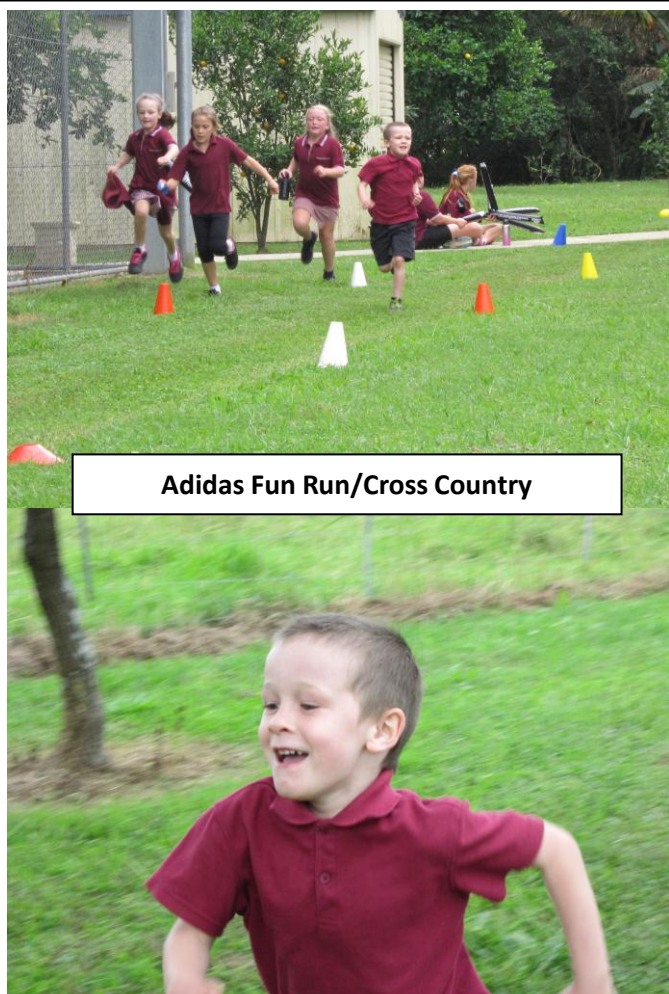
Adidas Fun Run/Cross Country